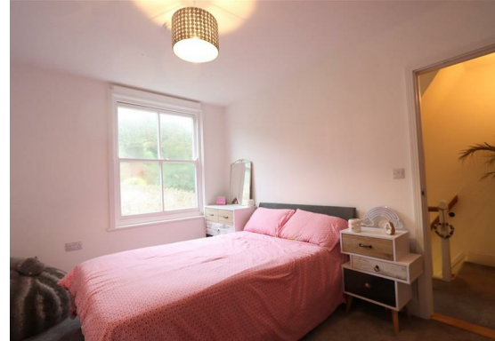
Bedroom 2 W.c Services